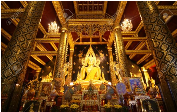
Praputtachinnarach, Phitsanulok (The most beautiful Buddha image)