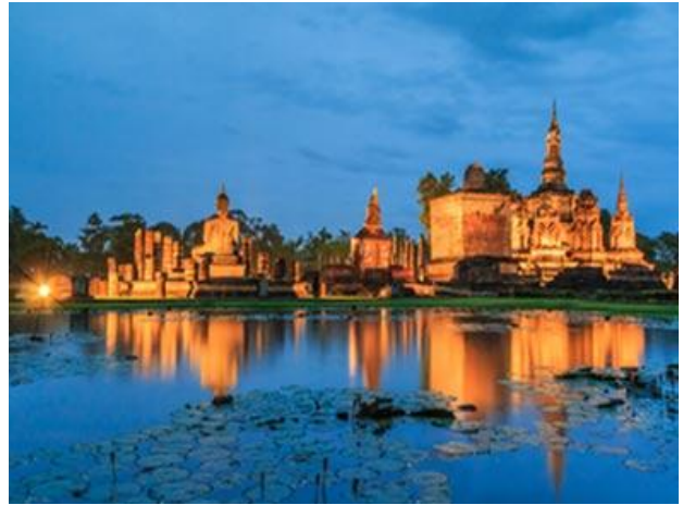
Sukothai World Heritage Historical Park, Sukhothai