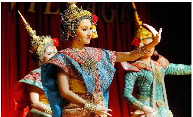
Thai Classical Dance