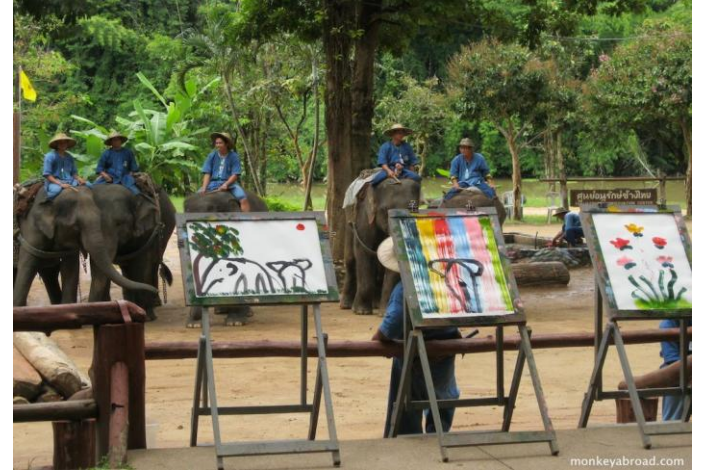
Thai Elephant Conservation Center, Lampang