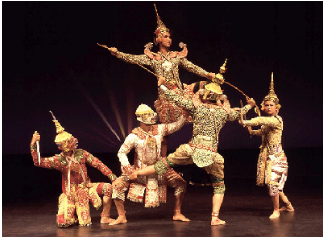
Khone – Thai drama enacting scenes from the Ramayana performed by dancers wearing masks who never speak