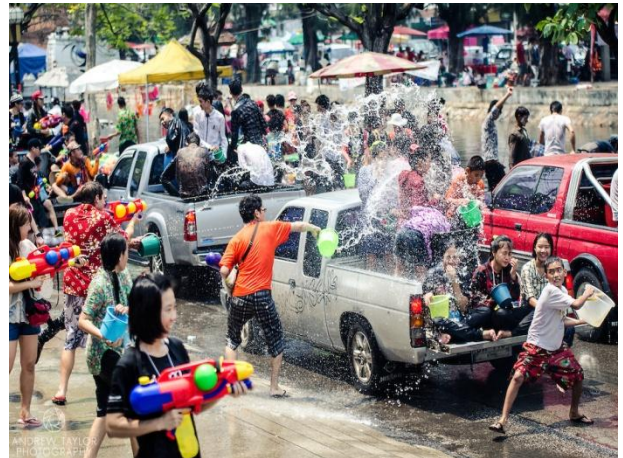
Songkran Festival – To splash water to another