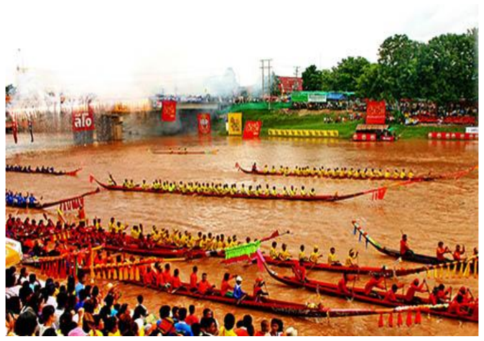
Long Boat Racing, Phichit