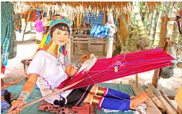
Long-neck Hill Tribe, Mae Hong Son