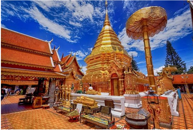
Doi Suthep Temple, Chiang Mai