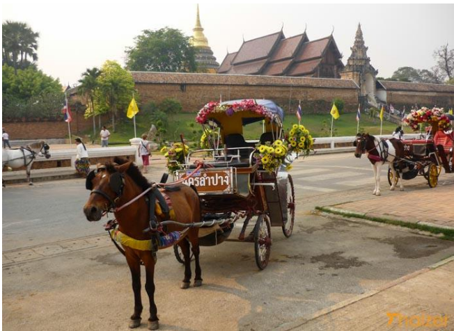
Horse drawn carriage, Lampang