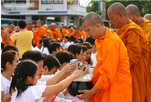
Takbaht, offering food to the Monk