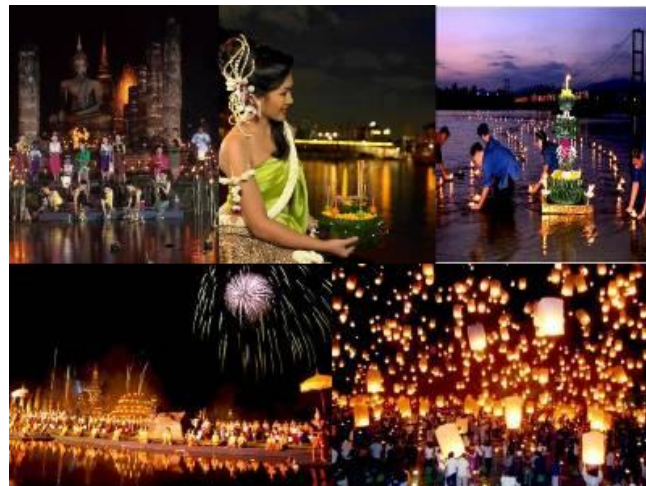
Loykrathong, Thai annual ceremony of Brahmin Origin, Sukhothai