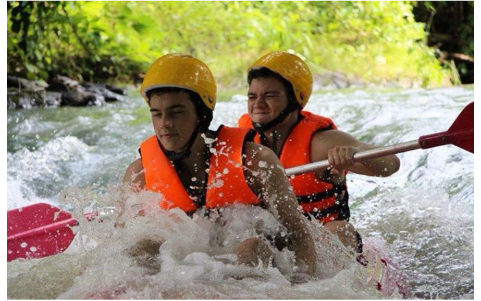
Boat Rafting, Khek River, Phitsanulok