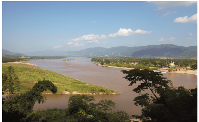
Golden Triangle, Chiang Rai (Sharing borders of Thailand, Laos & Myanmar)