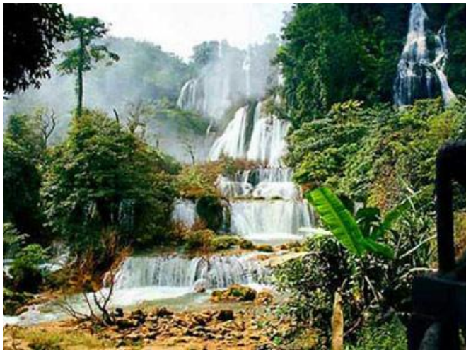
"Theelorsue" Waterfall, Tak